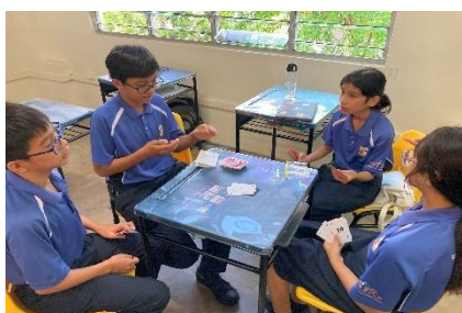
Math Learning Day