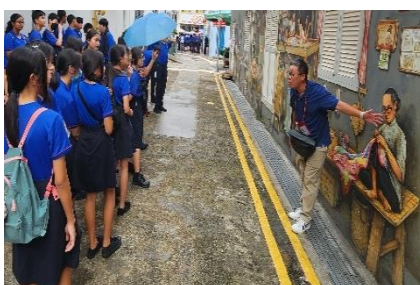
Humanities Learning Journey to Chinatown