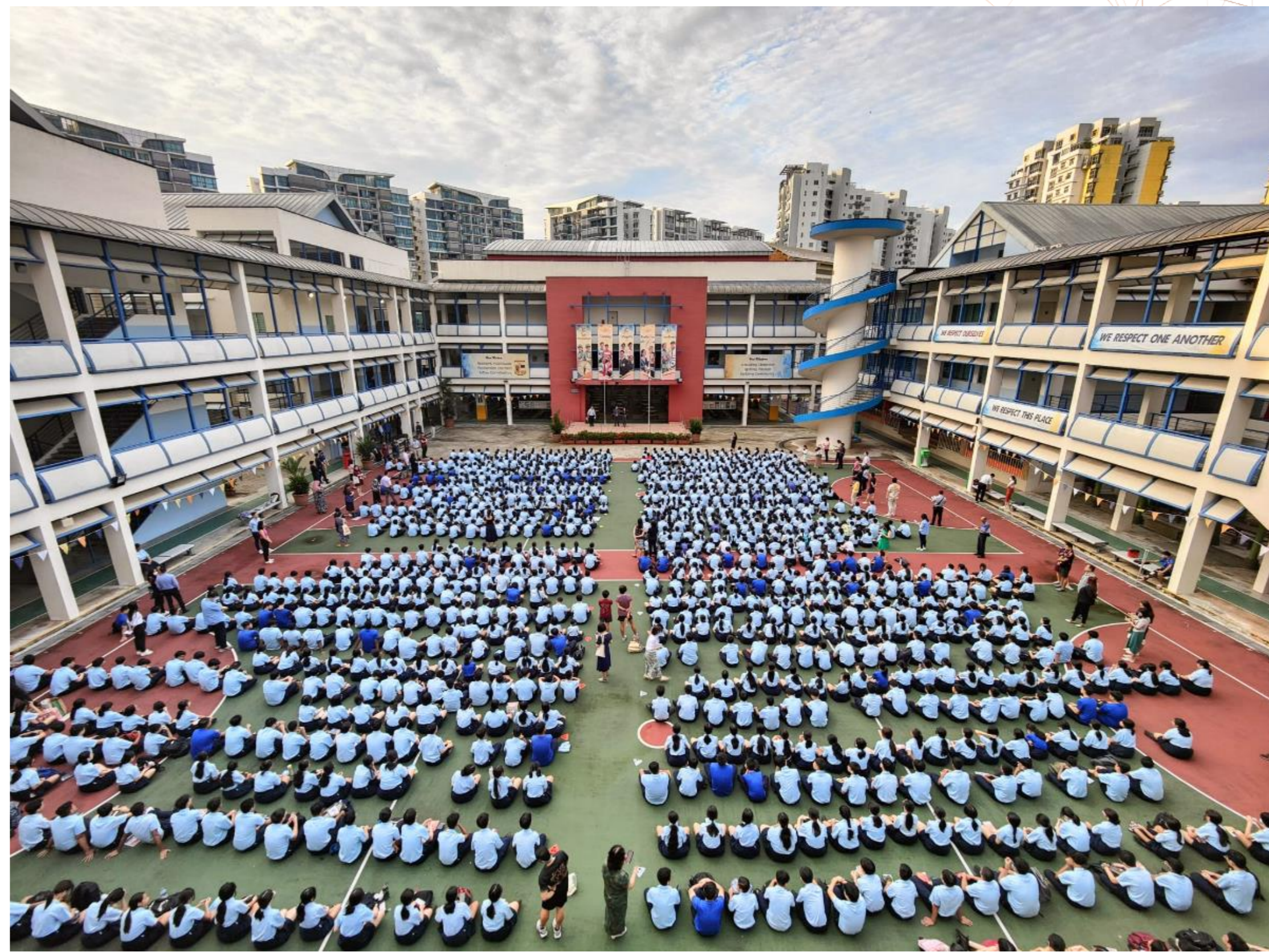
Settling in well and getting into the routines