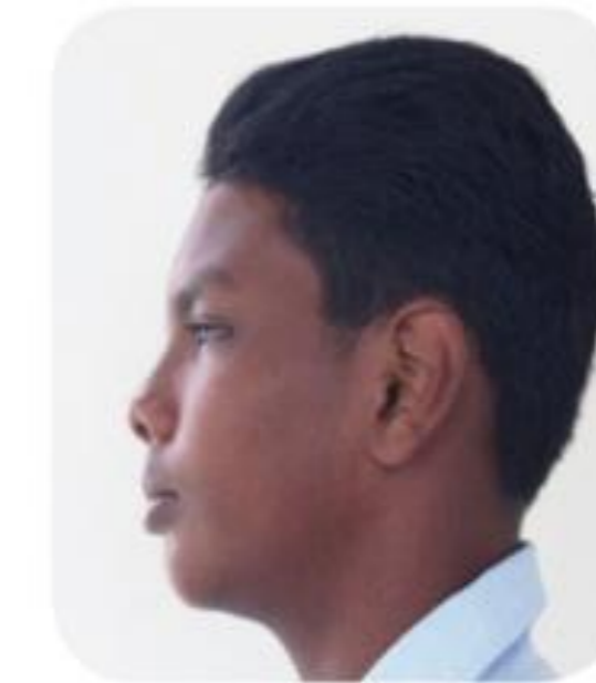
Sideburns are kept short with slope at the back