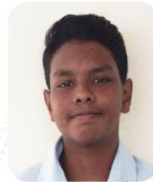
Fringe is above the eyebrows