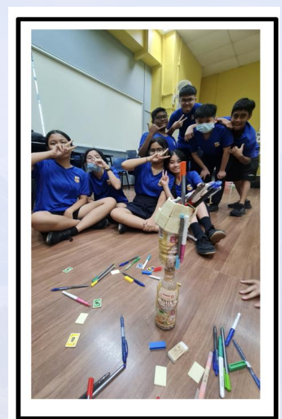
Sports & Games