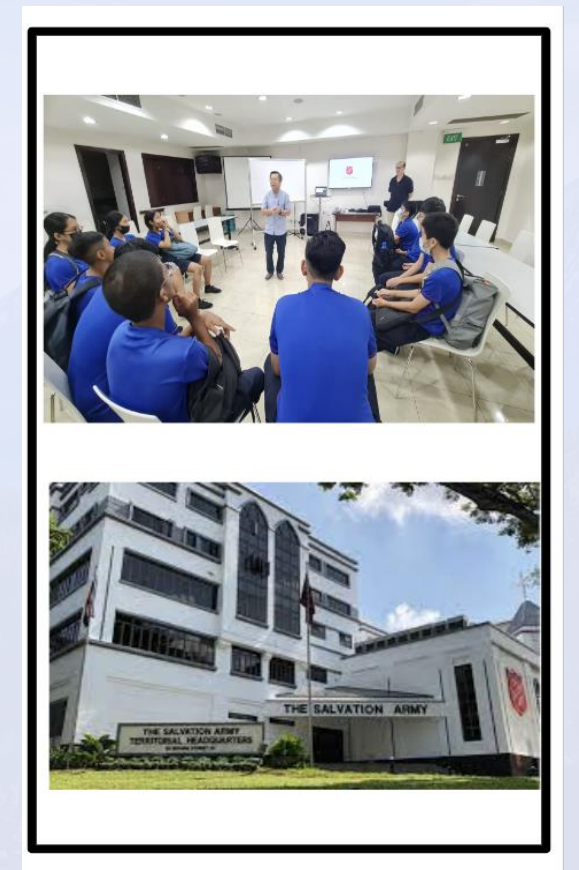
Learning Journey to Salvation Army